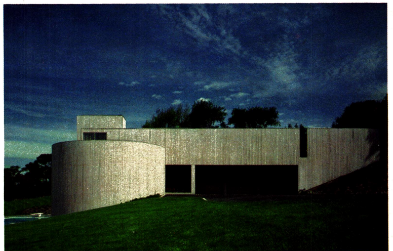
Around the corner and down a story is the house's main entrance—and a three-car garage. Pool's on the left, down another story.