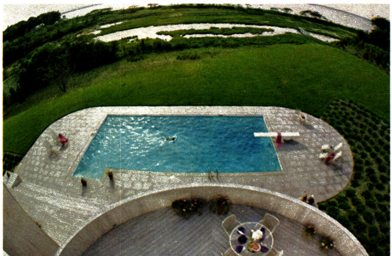
Sun-drenched balcony on second floor overlooks the pool, a marshland (see the house reflected in the marsh waters, above) and the Sound.

a pool links it visually to the sea. A dramatic two-story wall of windows opens the interior to the spectacular views, a more-than-adequate compensation for the rear, underground wall. Being close to nature was important for the owners, an active sports-minded family with three grown children. Architect Goldfinger worked around their needs and even incorporated a tennis court into the house's design—it's on the roof hidden from view in the front, but at ground level in the back. (Since the land slopes around the house, all three levels have ground entrances.) The childrens' rooms were placed on the lower pool level so that in their absence the house never seems empty. And on the second, main floor, two sculptural decks extend the living space.▶