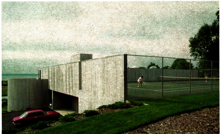
Since the back of the house is built into a hill, the third-story tennis court, adjacent to the master bedroom, is actually at ground level.