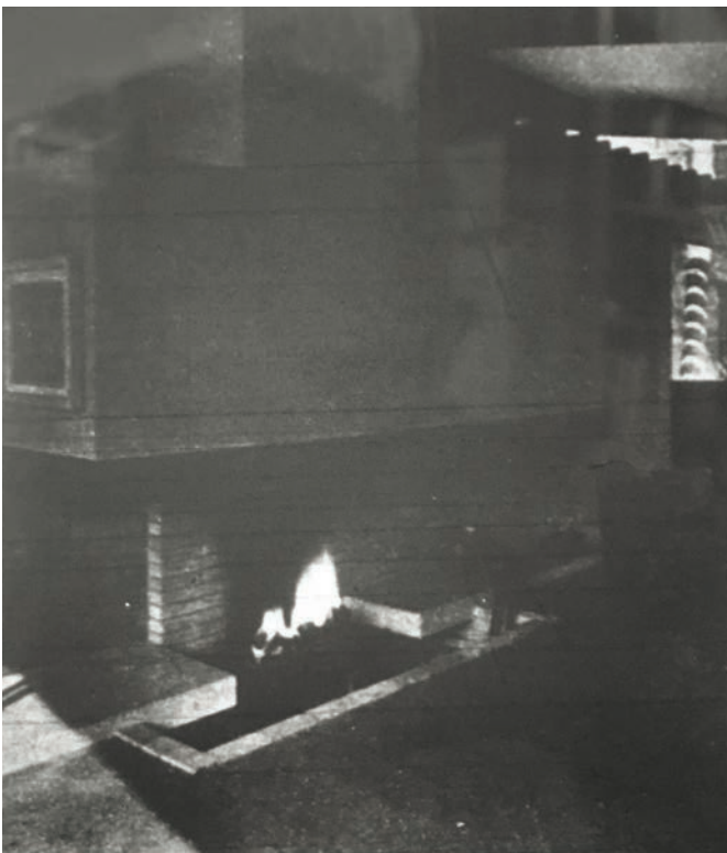
Unusual concrete-block fireplace is the focal point of the living room which has a glass wall (to left of photo) and a view window opposite. Both the living room and master bedroom have their own decks.