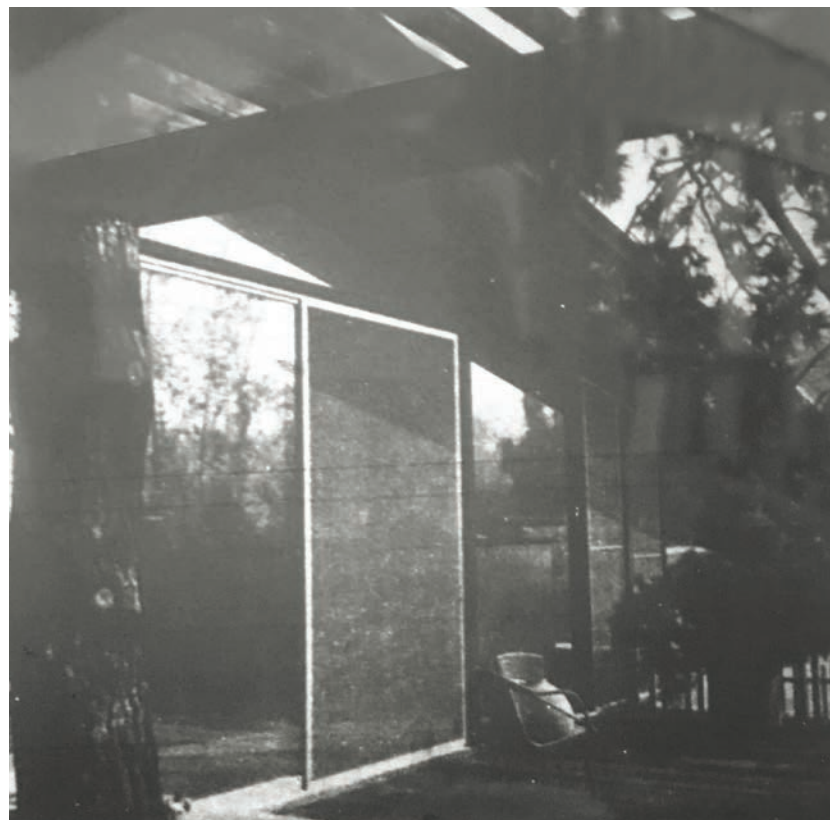
Extensive use of glass and outdoor decks creates a strong indoor-outdoor relationship in Gates home. Both living room and master bedroom have adjacent decks (above). Photo at left shows the degree of steepness in the site—steps lead from auto court, through a small entry garden and to the front door. Materials used in the house—redwood, concrete block and plaster—were left in natural state.