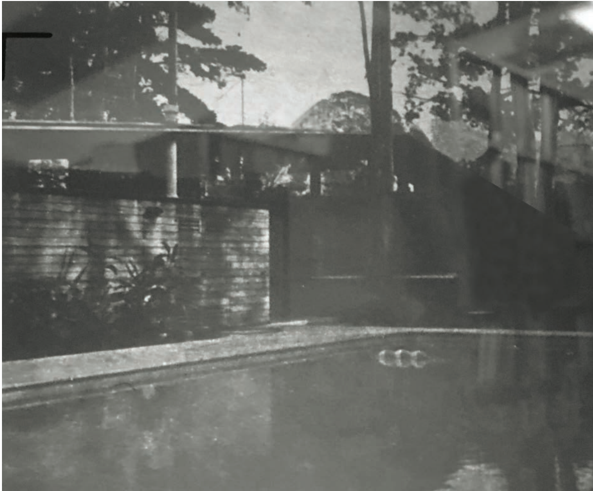
Swimming pool (left) and children's wing take up level land at the top of the half-acre lot. Preserving the natural beauty of the site was major consideration in designing the house. Note the provision for existing trees.