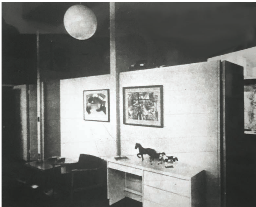
Children's bedrooms are located on the level portion of the hillside lot, can be made larger by knocking out walls as children grow older. Playroom (foreground) leads out to swimming pool which can be supervised from kitchen.

Adult living space is put on the sloping part of the lot. Living room is open to the master bedroom, but is separated with shelving.