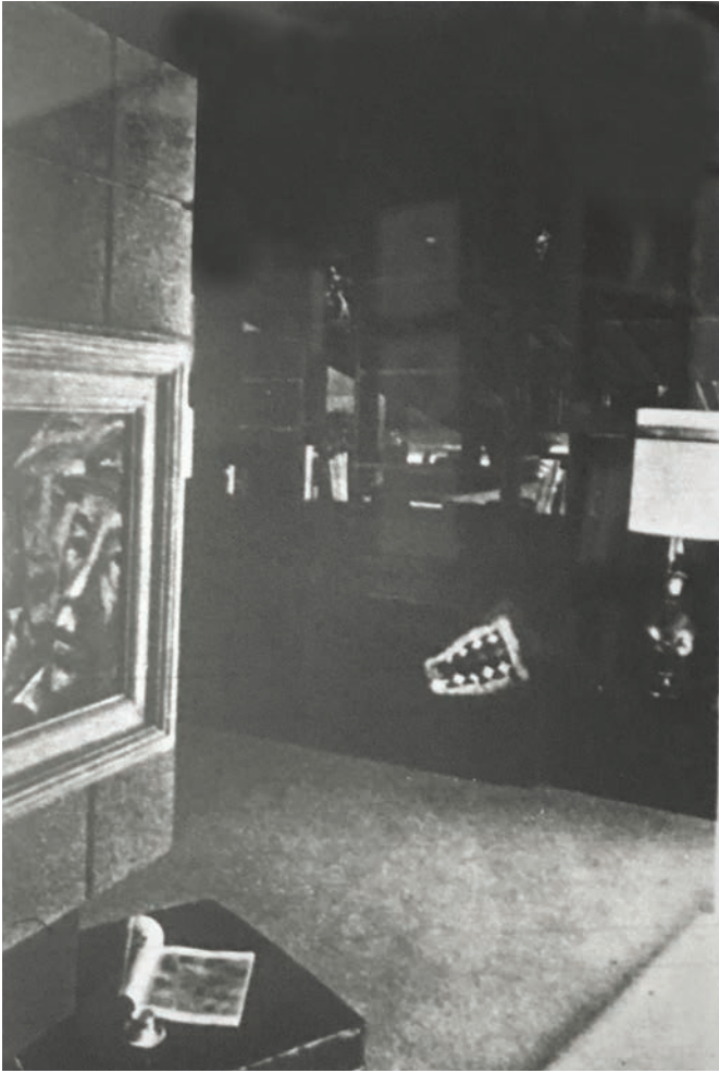
The formal living room (above), reserved for adult entertaining, is situated on the slope of the hill. The master bedroom is open to the living room, but separated by a series of shelves that create privacy.