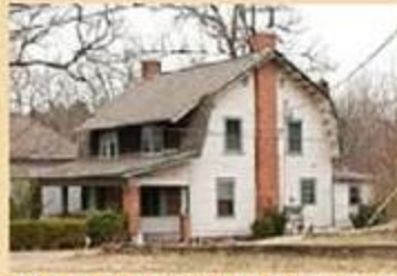
106 E. MARKHAM AVENUE