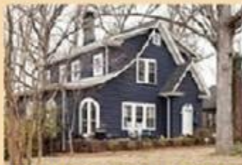
217 KNOX CIRCLE STREET