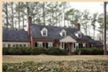
1423 ACADIA STREET