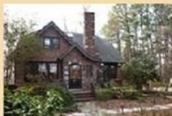
1417 ACADIA STREET