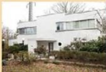
1307 MANGUM STREET