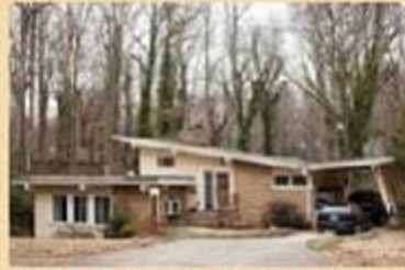
1617 SHAWNEE STREET