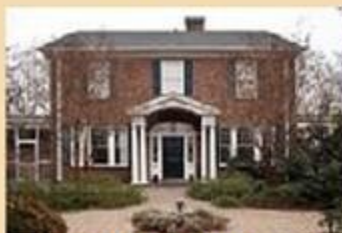
202 E. MARKHAM AVENUE

Saturday, May 7, 10-4pm, Preservation Durham's Duke Park House Tour. Visit classic homes in Duke Park (including two really cool Modernist houses). Walk, or drive your car. $25 per person day of tour. Tour details and special $20 advance discount tickets here . Mod Squad members get an even bigger discount! Deadline to purchase advance tickets: May 5.