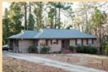
1913 GLENDALE STREET