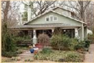
1405 MANGUM STREET