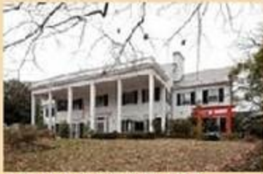
105 E. KNOX STREET