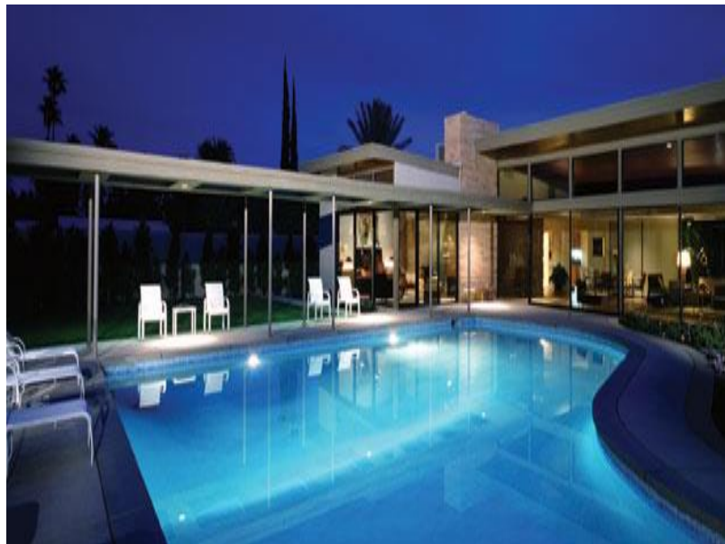
Frank Sinatra's House. Yes, we'll be going there!