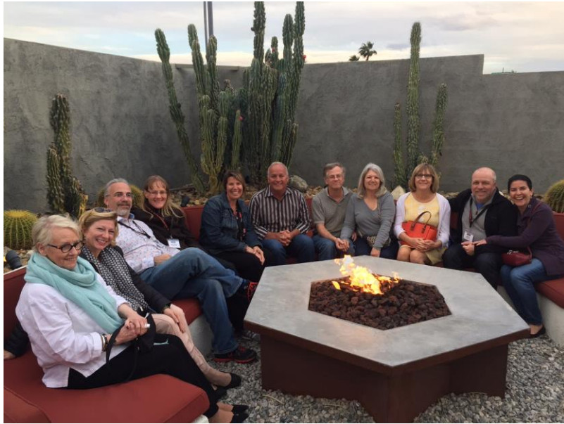
Hanging by the firepit at Hotel Lautner, designed by John Lautner . We'll be going there too.