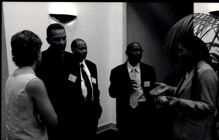
Participants at August 2002 chapter meeting.

All chapter program meetings are open to the public.