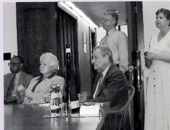
Opening of the Governor's Residence Competition at the Architectural Center

Expanding the services to our members statewide, using up-to-date technology, and how we use this ever-changing knowledge are constant concerns. New tools are being developed to make the Bookstore more accessible statewide through the web to create a virtual store: a one-on-one customer relationship that looks beyond our four walls and provides store services to the members with the move of a mouse. We are looking toward the store becoming more of a resource center. We're exploring new ways to promote to the public a broad awareness of the Architectural Profession, resulting in expanded sales of books, codes, documents, and items designed by architects. Additional staffing through shared association management for chapter and advertising will expand the horizon of AIA Indiana in 2003 and beyond. A new board manual is in the works; and I will have it for consideration in 2003.