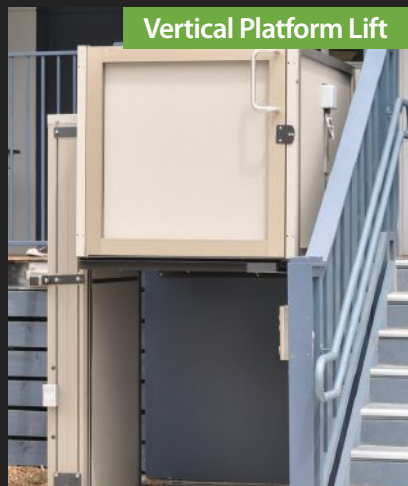
Vertical Platform Lift