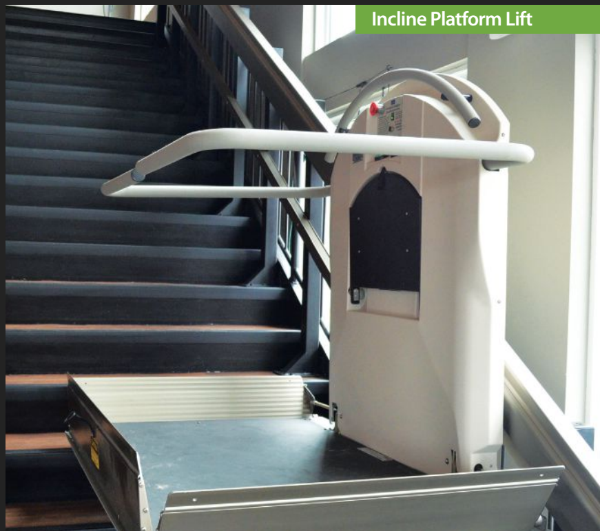
Incline Platform Lift