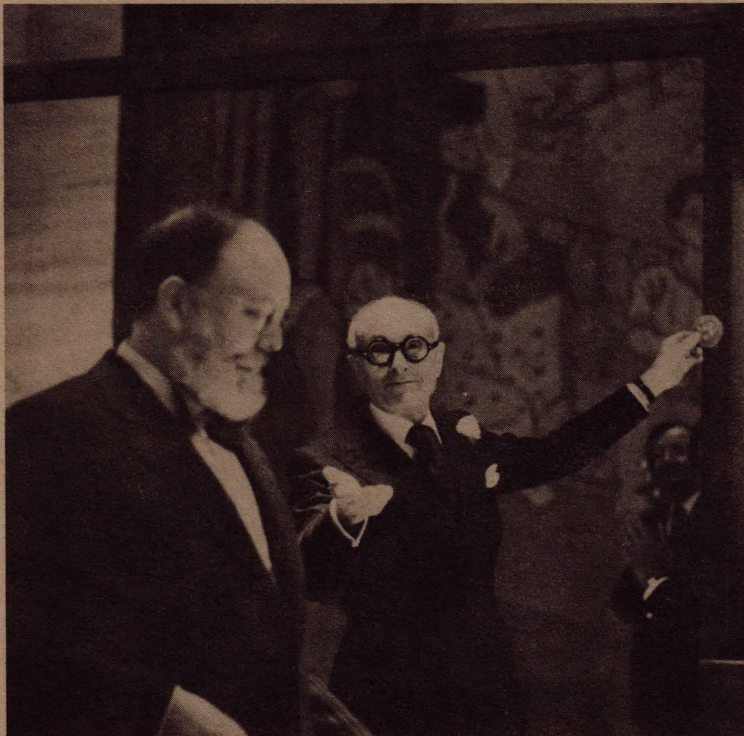
The Bronze Medallion on Seagram's Bronze.