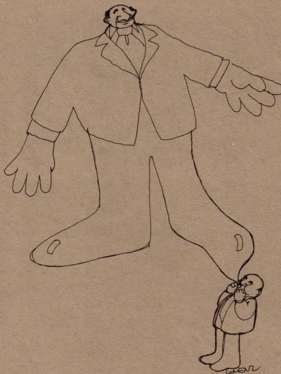
How to inflate your own...