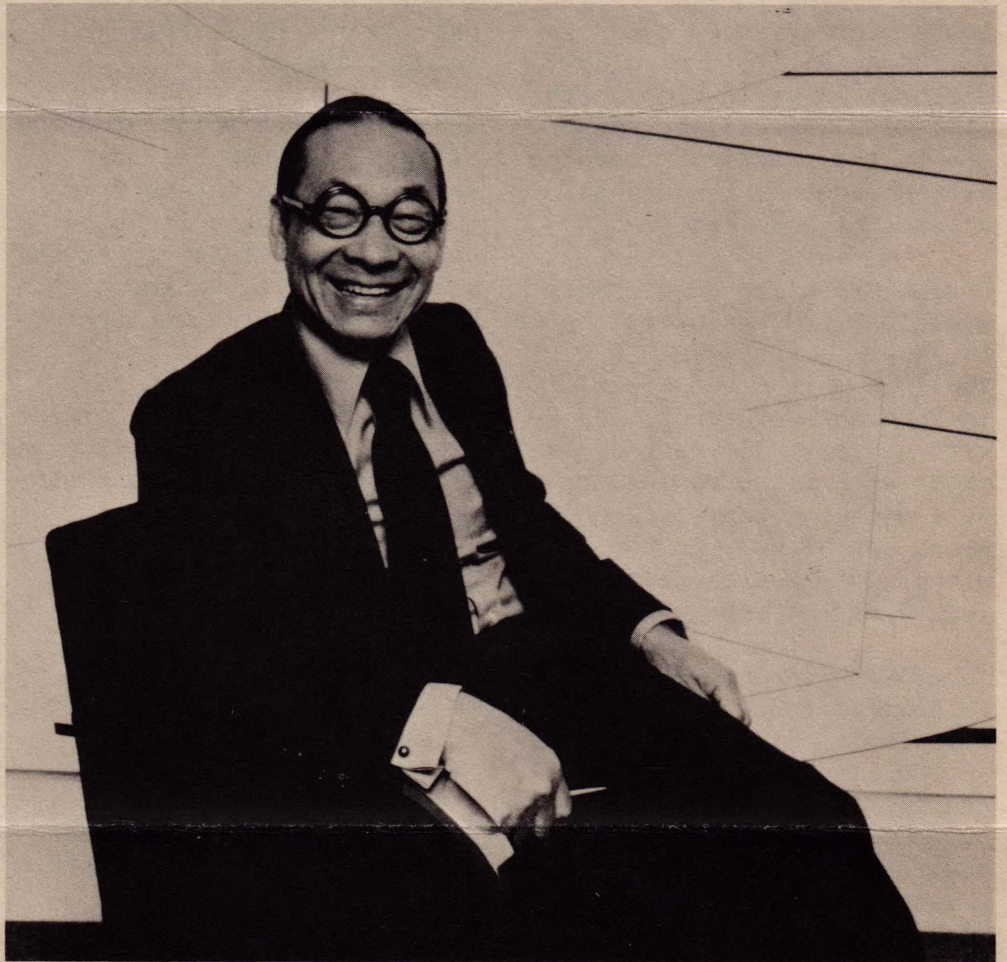
Ieoh Ming Pei

By the required three-quarters vote the Institute Board at its December meeting elected Ieoh Ming Pei to receive the AIA's highest award, its Gold Medal. This is the second year in a row that it has gone to a New York architect, Philip Johnson having won it last year.