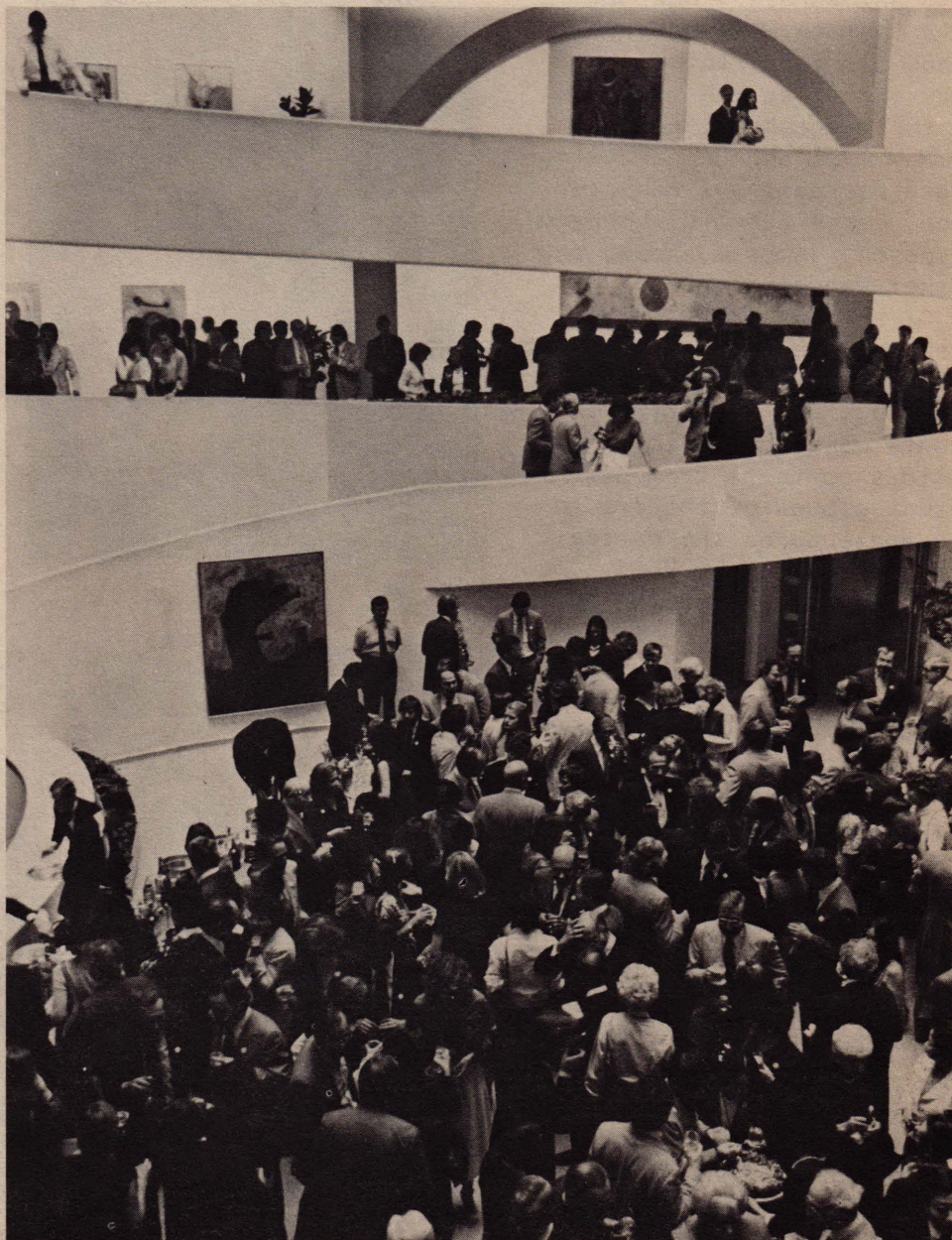
Chapter Celebration for I.M. Pei. See pages 2 and 3.