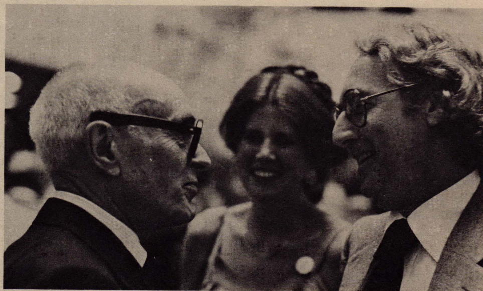
Philip Johnson with Mr. and Mrs. Richard Meier.