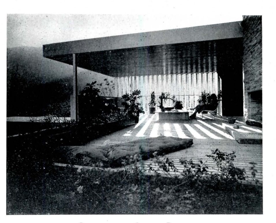
RESIDENCE IN THE COLORADO DESERT RICHARD J. NEUTRA, F.A.I.A., ARCHITECT