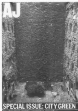
SPECIAL ISSUE: CITY GREEN

Green cities. 'The city green' special issue 5/2 p28-67