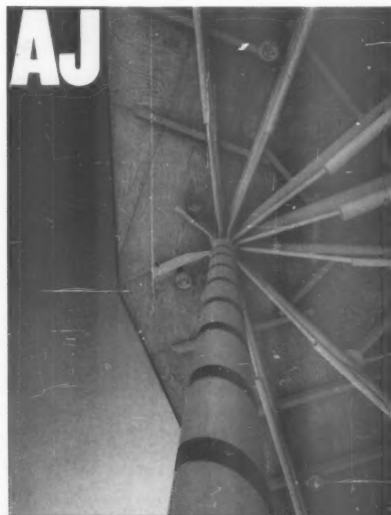
GERMAN LESSONS: EDUCATIONAL ARCHITECTURE AT LORCH REFURBISHMENT OF THE THEATRE ROYAL, PORTSMOUTH THE ARCHITECTS' JOURNAL 24 SEPTEMBER 1986/£1