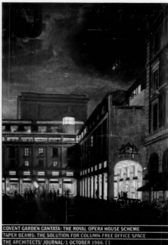
COVENT GARDEN CANTATA: THE ROYAL OPERA HOUSE SCHEME TAPER BEAMS: THE SOLUTION FOR COLUMN-FREE OFFICE SPACE THE ARCHITECTS' JOURNAL 1 OCTOBER 1986 C1