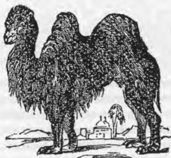
Fig. 122. — BACTRIAN CAMEL.