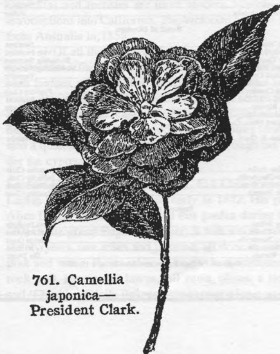
761. Camellia japonica— President Clark.

California Garden & Landscape History Society Membership Secretary P.O. Box 1075 Palo Alto, CA 94302-1075