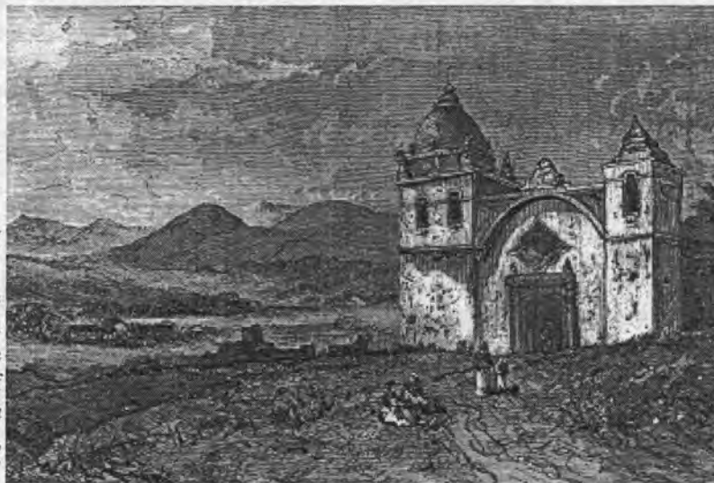
Carmel Mission, 1892

Custom House & Garden (1827). Calle Principal @ Decatur Street. This garden was altered in the 1980s to reflect the minimal planting that would have been typical of the Mexican era. It contains cacti, succulents, pepper trees, cypresses and coast live oaks in a large open space, in the manner of a swept yard.