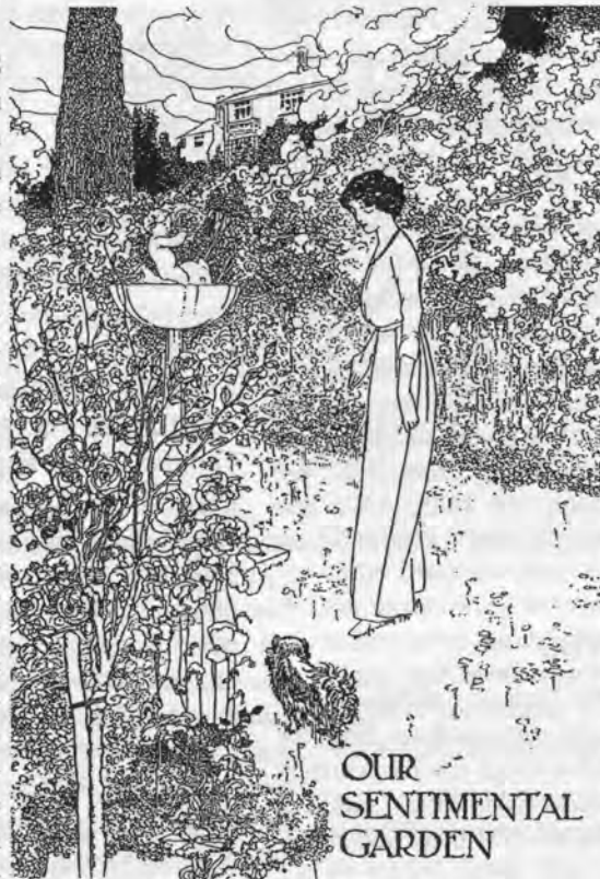
OUR SENTIMENTAL GARDEN

April 28 or 29: Elizabeth F. Gamble Garden Center sponsors their annual Spring Garden Tour of five private Palo Alto gardens. Tour tickets are $23 (good for either day) and lunch tickets are $15. Lunch by advance reservation only from 11 A.M. to 2 P.M., at the Gamble Carriage House. Please reserve no later than April 20 th . Send a SASE with your remittance to Gamble Garden Center, 1431 Waverley