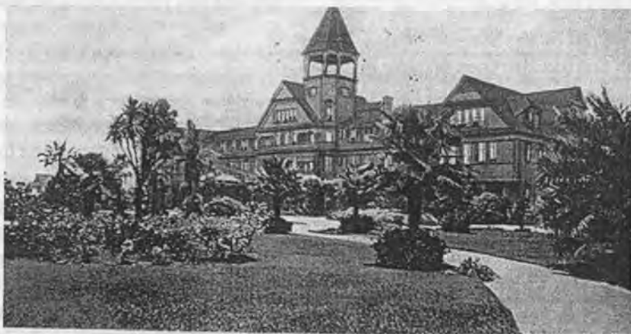
Hotel Arcadia, Santa Monica