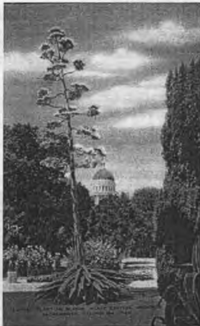
Garden or Landscape?

With landscape , the dictionary will confuse rather than clarify for most people because there are many definitions. The one I chose is best for my purpose here: “an expanse of natural scenery seen by the eye in one view.” The key word there is “natural.” I can think of some great landscapes that qualify by that definition. Ninfa, south of