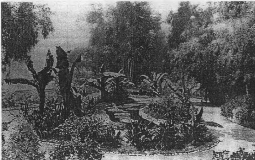
Do you know this garden? Circa 1924.