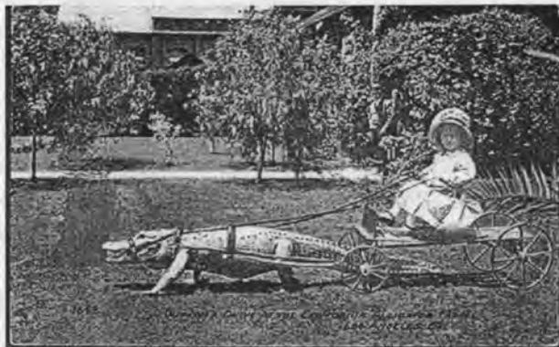
A Ride at the Alligator Farm, Calif.

seen the flowers depicted variously as white, yellow, pink and red), they were not above adding more flowers than naturally appeared if they thought it would increase saleability. And sometimes the e-bay sellers give wrong information. We found "A Garden View" and were told it was in San Jose. We accepted this right up until we found the identical view with additional information on