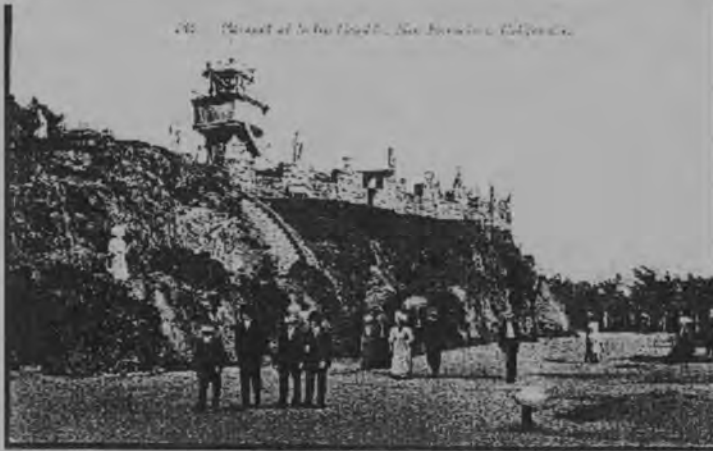
List of Illustrations