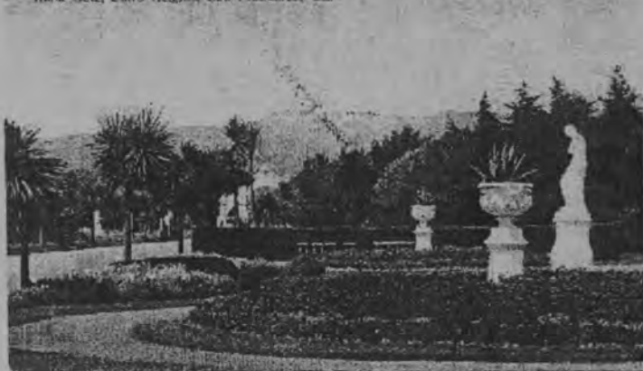
Maria Gate, Sutter Heights, San Francisco, Cal.

The numerous refinements and changes that occurred between 1882 and 1890, as shown on the many extant photos and on the two plans, reflect, in large part, the influence of Sutro's trips abroad. The San Franciscan's leisurely mornings at the Luxembourg Gardens or the Tuilleries "with its great orange trees in tubs and its vast population of statues" were behind the arrival of Homer, Hebe, Adonis, a Venus by Canova, and more than one hundred other pieces of cast-concrete, reproduction statues. 11 Set in the circles, along the roads, at the edge of the Old Grove, and on top of the crenellated wall of the parapet, the sculpture added Old World ambiance to the Pacific Ocean setting. In order that the populace might reflect on these works of art, Sutro also borrowed from Paris the idea of hundreds of simple slat chairs dotted everywhere.