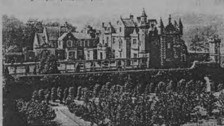
Abbotsford House, South Front.

In 1885, with admonitory signs at the entrance—"Lunches and Packages not allowed; Walk your horses; Keep to the right"—Sutro welcomed the world into what must have seemed a paradise to both the lowly and mighty of San Francisco. Certainly it was celebrated enough in local song and verse. A still-anonymous head gardener kept the Eucalyptus trimmed high and the Salvia and Echeveria in the carpet beds in perfect alignment.