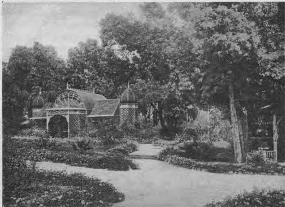
The Moorish House in Paul de Longpre's gardens, Hollywood, Cal.