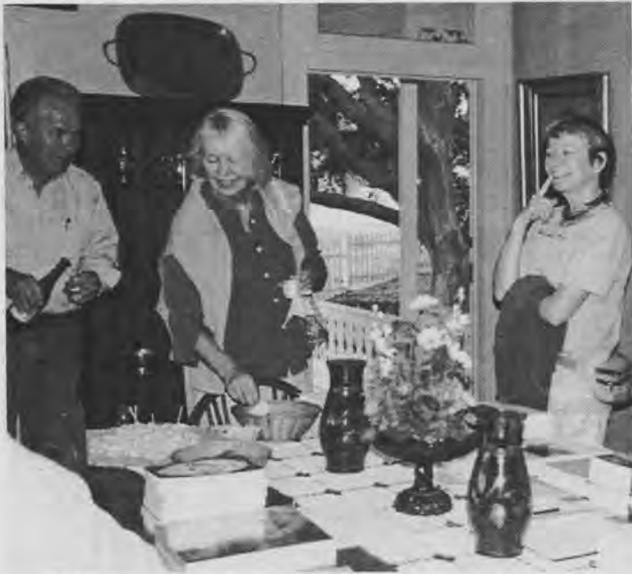
Members enjoyed the hospitality at the O'Neill House Museum on Friday night.