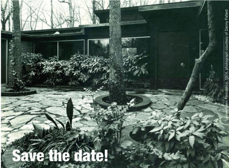
Loewenstein Residence, 1974