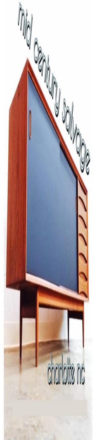
Fine Mid Century and Danish Modern Furniture Store in Charlotte. Phone Orders Welcome, Shipping Available

Saturday, October 11, 9am-6pm. AIA Triangle hosts the AIA Triangle Residential Architecture Tour , featuring nine homes on the self-guided tour. Purchase tickets, begin at the residence of your choice, and tour at your leisure. Architects and docents will be available to answer questions. Details and tickets here .