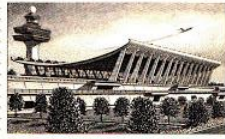
Architecture USA 20c

Special offer: through 6pm tonight, any donation over $25 or any new Mod Squad membership receives four mint, never-used, out-of-print architecture stamps featuring famous Modernist buildings by Wright , Gropius , Van