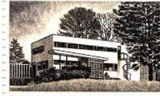
Architecture USA 20c