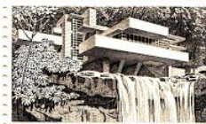
Architecture USA 20c