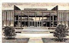
Architecture USA 20c