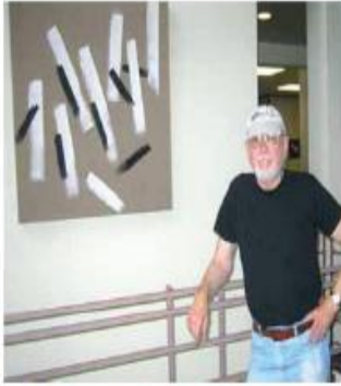
'A Nod To Thelonious', in Chapel Hill Town Hall.

Fine art from a nationally exhibited artist...abstract, figurative, minimalist.