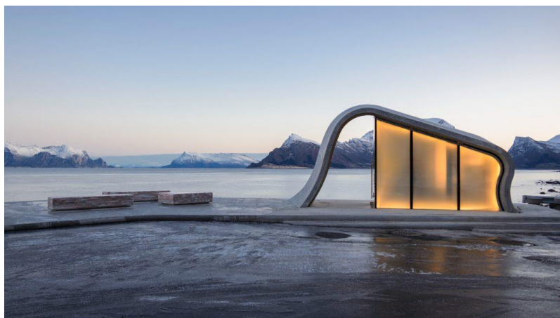
From Dezeen: The world's prettiest rest stop .