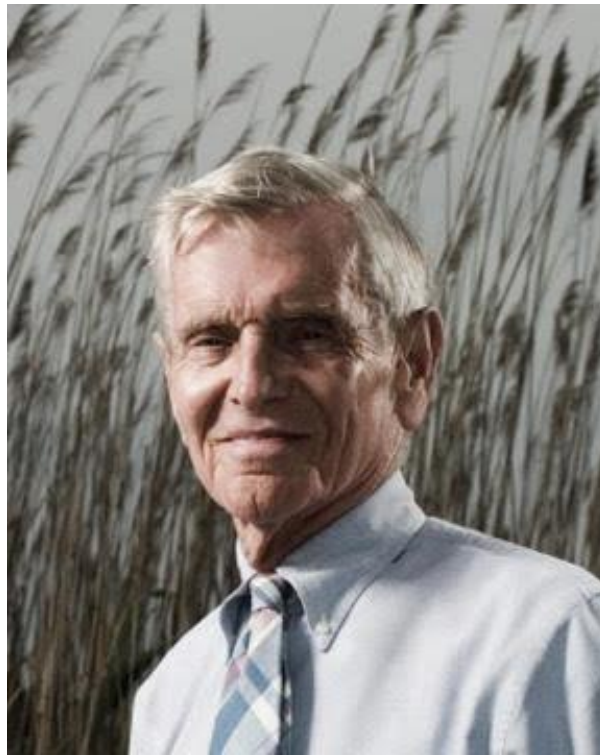
Harry Bates: the unsung Modernist hero of the Hamptons.