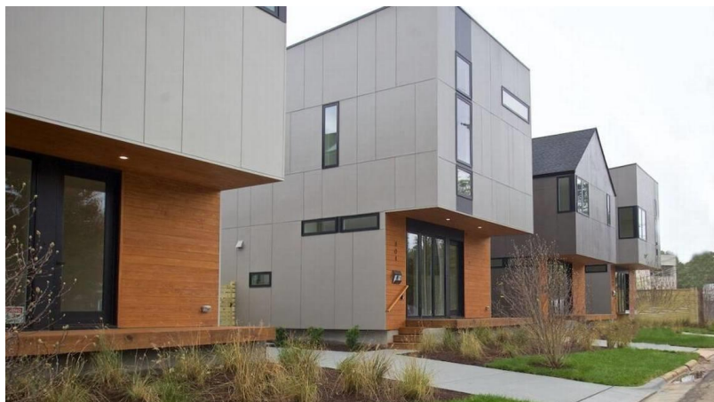
A new Modernist neighborhood: 4 of 9 Modernist