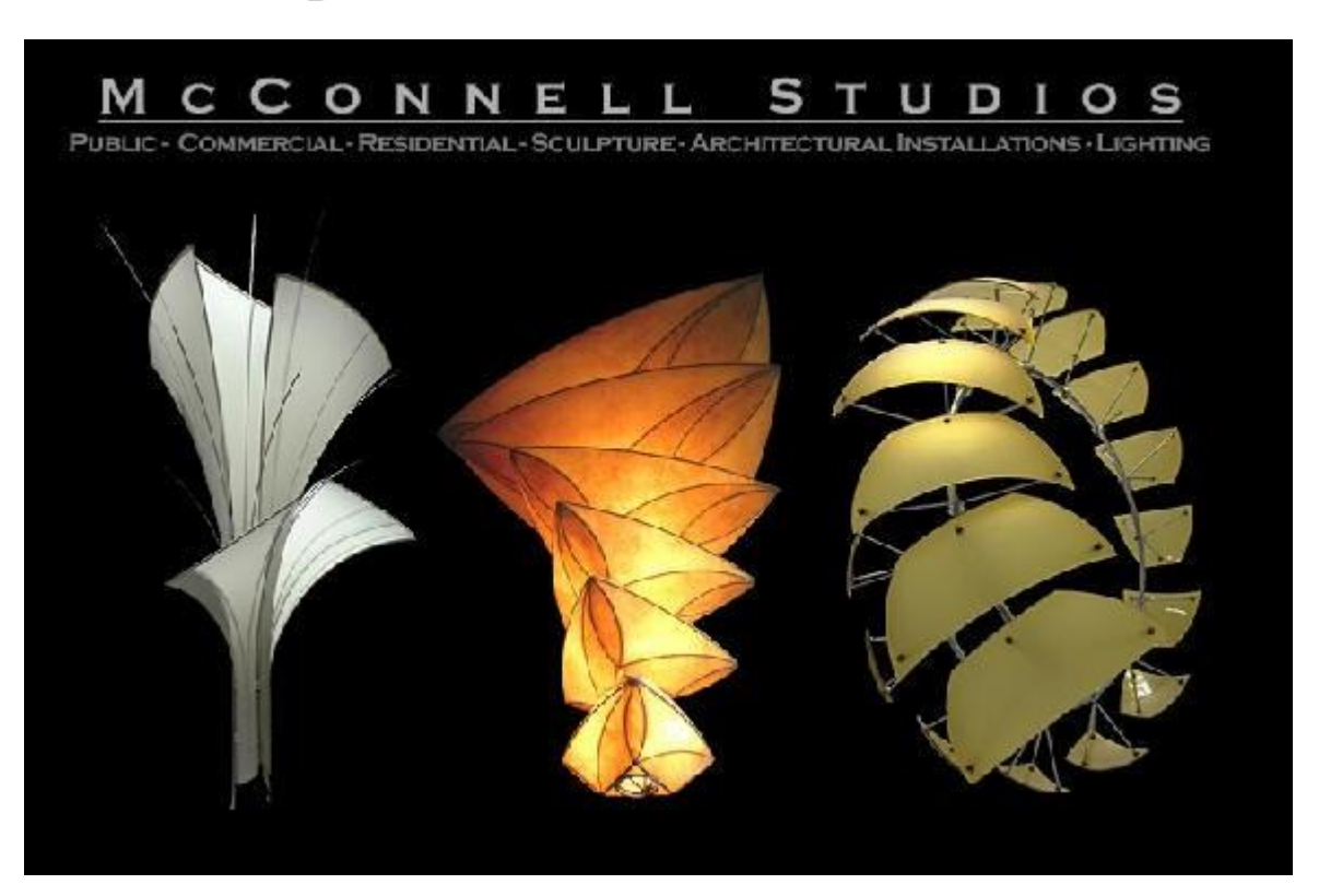
Thirst4Architecture, Thursday, July 25, 6-8pm, hosted by McConnell Studios, 324 Dupont