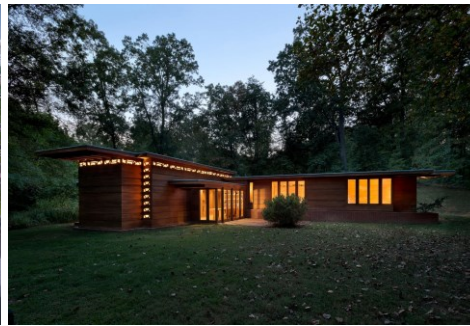
Only 3 seats left! USModernist Tour May 1-3 of Washington DC! Including Hollin Hills Homes and Gardens, open only once every two years. <u>Details and tickets</u>.