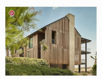
FIGURE 8 HOUSE - Point Office