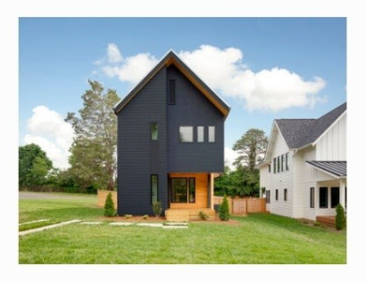
EL SEGUNDO - The Alter Architect's Studio