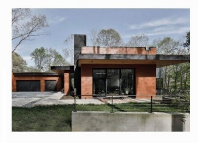
MODERN TREEHOUSE - Szostak Design