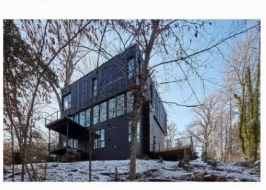
HAYMOND RESIDENCE - tonic design