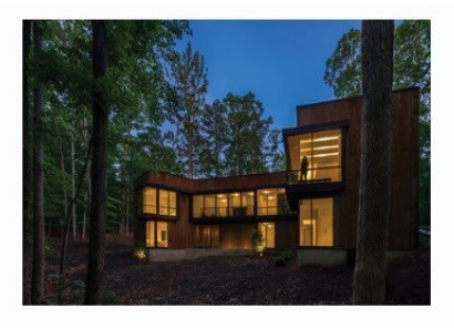
PIEDMONT RETREAT - tonic design