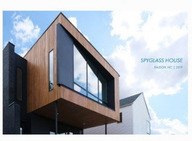
SPYGLASS HOUSE - Nick Hammer Architecture