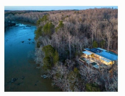
HAW RIVER HOUSE - Arielle C Schechter