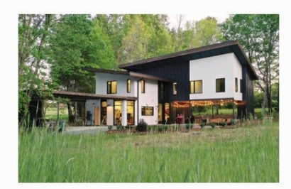
ACORN ACRES - Calico Studio PLLC