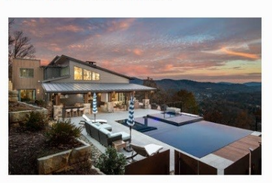
9 ELLINGTON - Retro+Fit Design