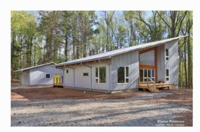
BLECHER RESIDENCE - BuildSense