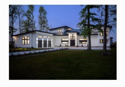
RED BANKS - 2x4 Designs