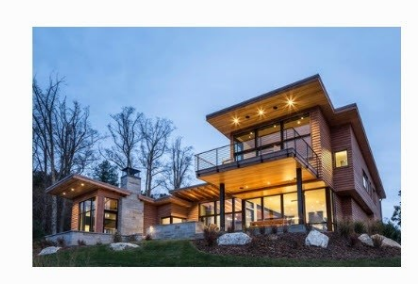
BARTRAM'S WALK - Brickstack Architects