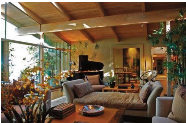
Cliff May home in Encino.