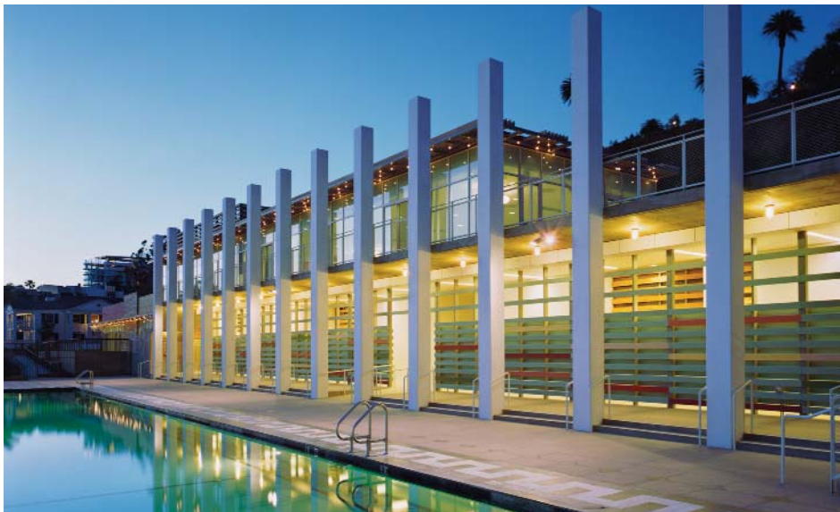
Annenberg Community Beach House (2009) by Frederick Fisher and Partners Architects.

As always, this special SAH/SCC event is free to members in good standing. We encourage you to bring friends who might want to join the SAH/SCC member roster. Guests are $10, which is applicable to new membership dues. Space is limited, so call 800.9SAHSCC for member reservations, or use Order Form on back page.