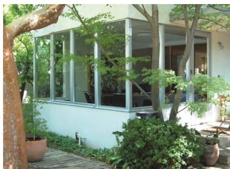
Neutra's Davis Residence (1937).

Don't miss the opportunity to visit these three inspirational homes. Coach seating is limited to 20 people, so sign up now to avoid disappointment!