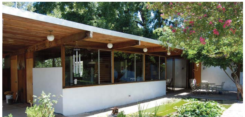
Neutra's Leddy Residence (1958).