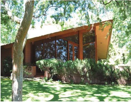
Ablin Residence by Frank Lloyd Wright.