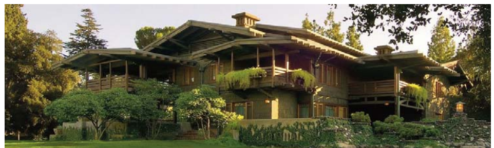
David P. Gamble House, Pasadena.

Architecture in Film. See Page 5 for details.