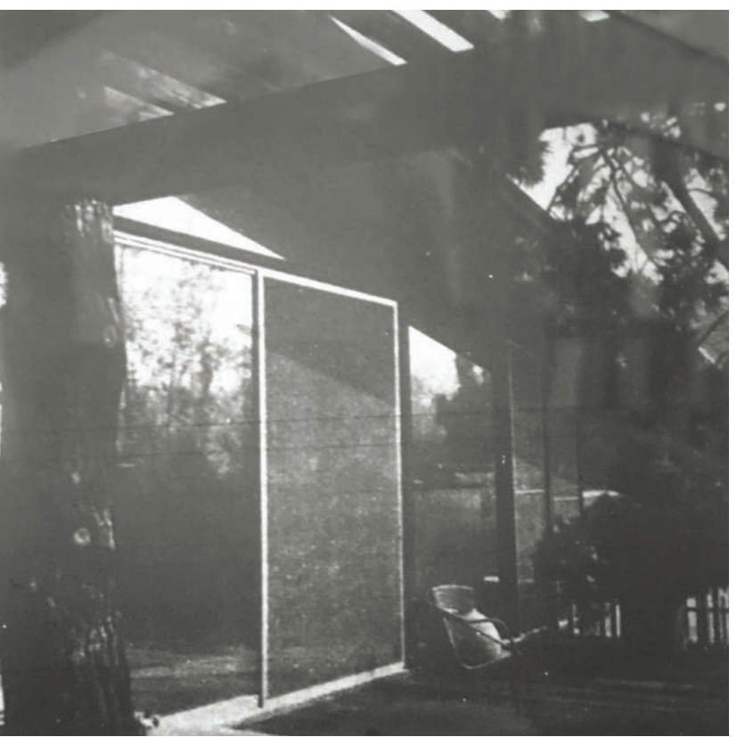
Extensive use of glass and outdoor decks creates a strong indooroutdoor relationship in Gates home. Both living room and master bedroom have adjacent decks (above). Photo at left shows the degree of steepness in the site—steps lead from auto court, through a small entry garden and to the front door. Materials used in the house redwood, concrete block and plaster—were left in natural state.