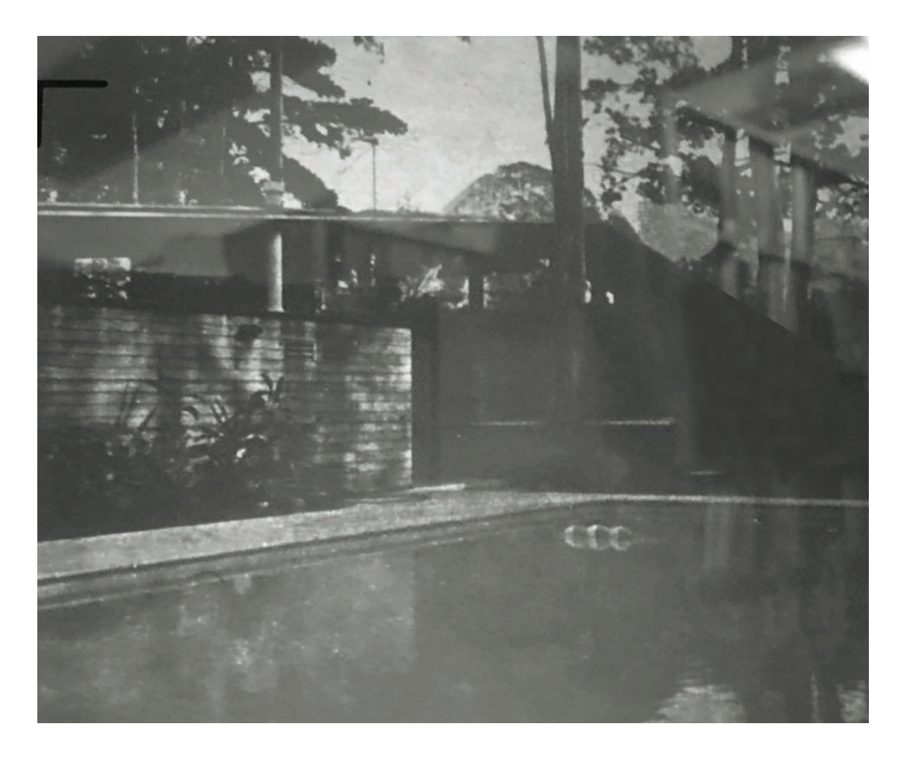
Swimming pool (left) and children's wing take up level land at the top of the half-acre lot. Preserving the natural beauty of the site was major consideration in designing the house. Note the provision for existing trees.