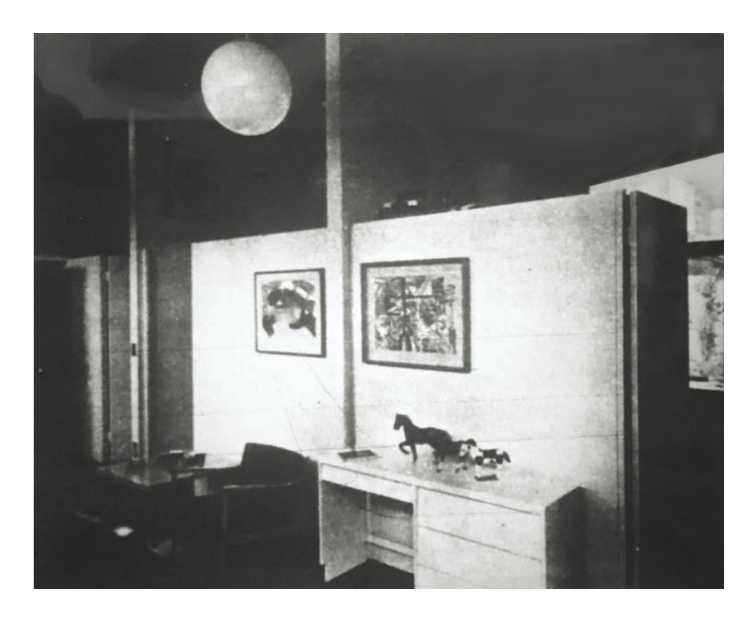
Children's bedrooms are located on the level portion of the hillside lot, can be made larger by knocking out walls as children grow older. Playroom (foreground) leads out to swimming pool which can be supervised from kitchen.

Adult living space is put on the sloping part of the lot. Living room is open to the master bedroom, but is separated with shelving.