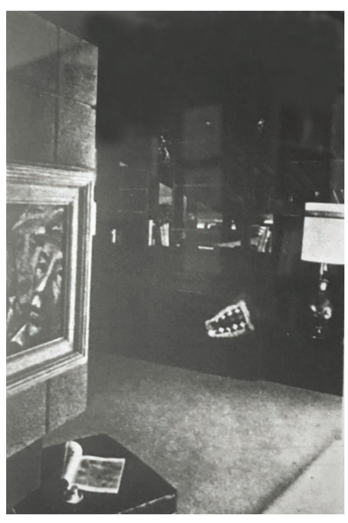
The formal living room (above), reserved for adult entertaining, is situated on the slope of the hill. The master bedroom is open to the living room, but separated by a series of shelves that create privacy.