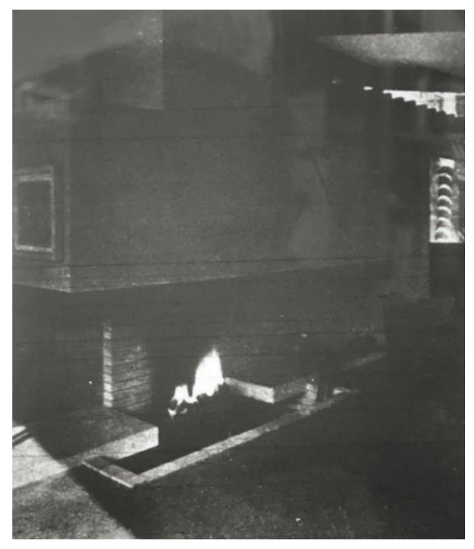
Unusual concrete-block fireplace is the focal point of the living room which has a glass wall (to left of photo) and a view window opposite. Both the living room and master bedroom have their own decks.